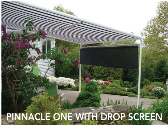
PINNACLE ONE WITH DROP SCREEN